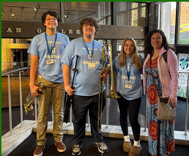
Three Berlin High School Musicians Perform In Hartwick Honor Band