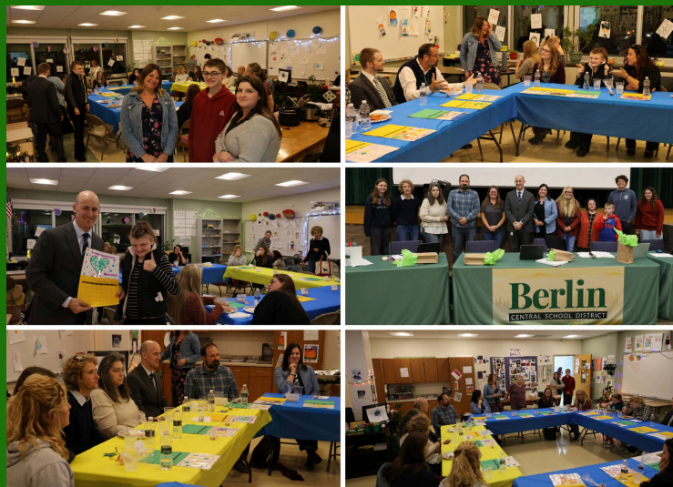
BCSD Shares Appreciation for Its Board of Education Members