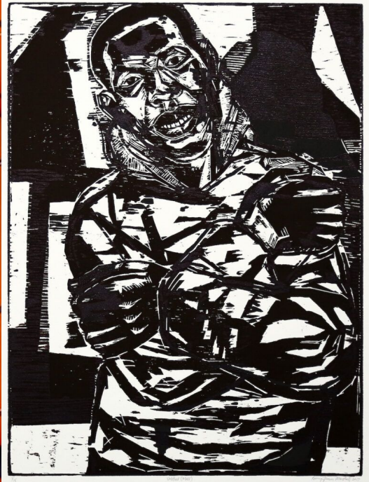
A. Kerry James Marshall