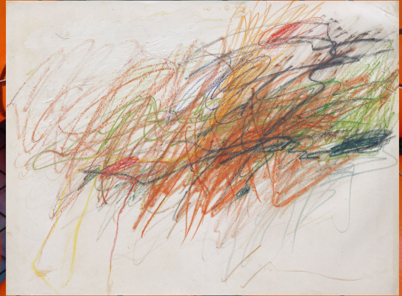
B. Cy Twombly