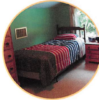
Youth Shelter 518.584.6042

National Runaway Switchboard 1-800-RUN-AWAY (1-800-786-2929)